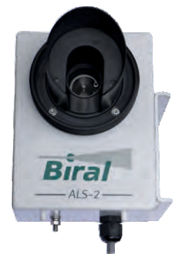
Biral's ALS-2 Ambient Light Sensor

The SWS sensor family is designed for easy installation by a single person and has an interface which simplifies system integration. The ASCII text data message is transmitted at user defined time periods or in response to a polled request. The standard data message provides MOR and EXCO along with present weather codes according to both WMO Table 4680 and METAR standards. An optional interface to the ALS-2 Ambient Light Sensor simplifies use in aviation applications where both METAR and RVR information is required. The ALS-2 Ambient Light Sensor data is appended to the standard sensor data message simplifying both installation and data processing.