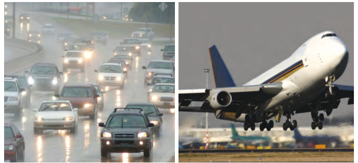
Suitable for a range of applications.

In aviation there is a trend towards increasing both safety and capacity at aerodromes which can require the installation of visibility and present sensors on runways and increasingly along taxi ways. The SWS-250 meets or exceeds all international aviation specifications for visibility measurement and present weather reporting whilst offering an affordable solution for both acquisition and cost of ownership.