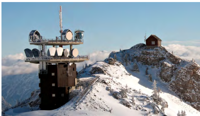
The SWS-250 is ideally suited to provide accurate measurement of raw data for forecasting models.

Whilst the models used for forecasting continue to improve there remains a need for accurate measurement of current weather conditions to provide the model's input. Improvements to forecast accuracy can also be gained by increasing the number of monitoring sites but there is always a trade-off